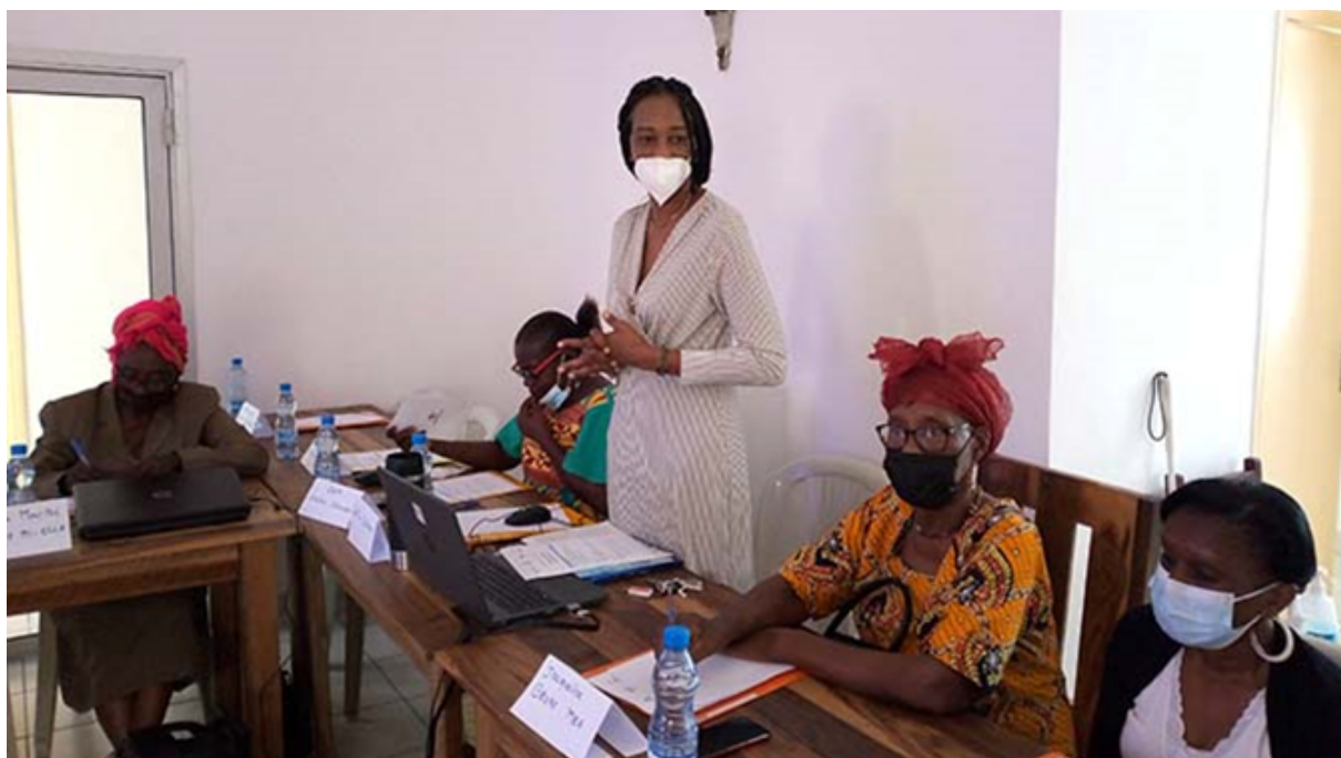
Women leaders meeting