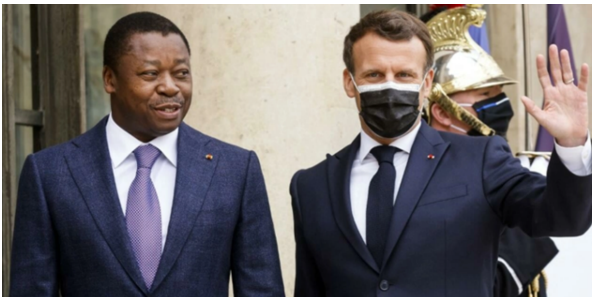
Meeting between the Togolese (left) and French (right) Presidents