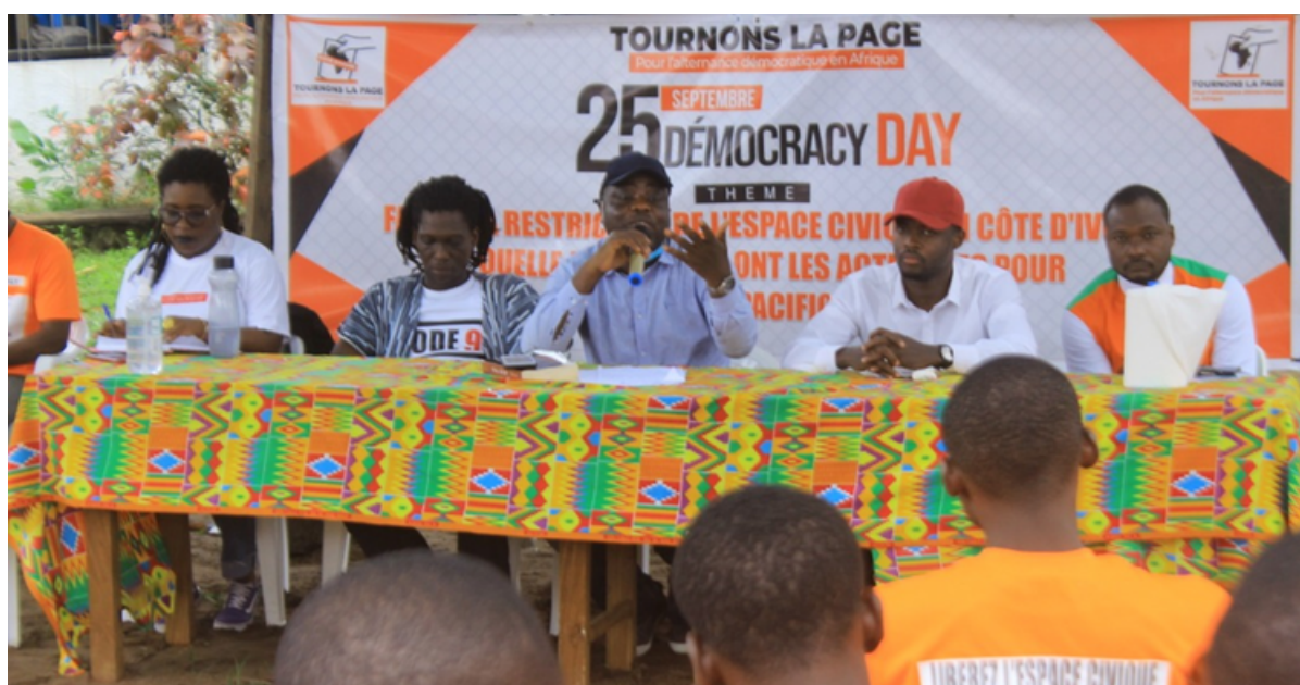
Roundtable discussion on the restriction of civic space