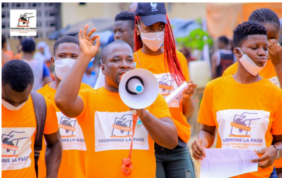
Mobilization of TLP-Ivory Coast members