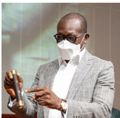
Patrice Talon holding up the baton, symbol of political change

This summit was centered on the theme "ECOWAS Vision 2050: towards an ECOWAS of the People". At the end of this summit, a declaration called the Cotonou Declaration was proclaimed. This declaration is of paramount importance as it establishes as an intangible principle the limitation to two presidential terms.