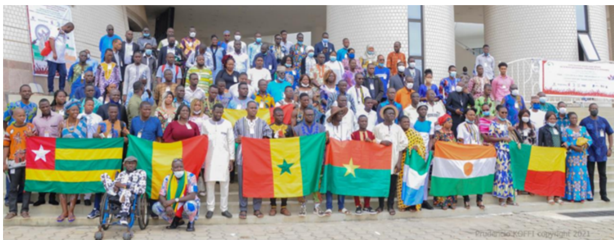
Participants of the youth day gathered in front of the Palais des Congrès