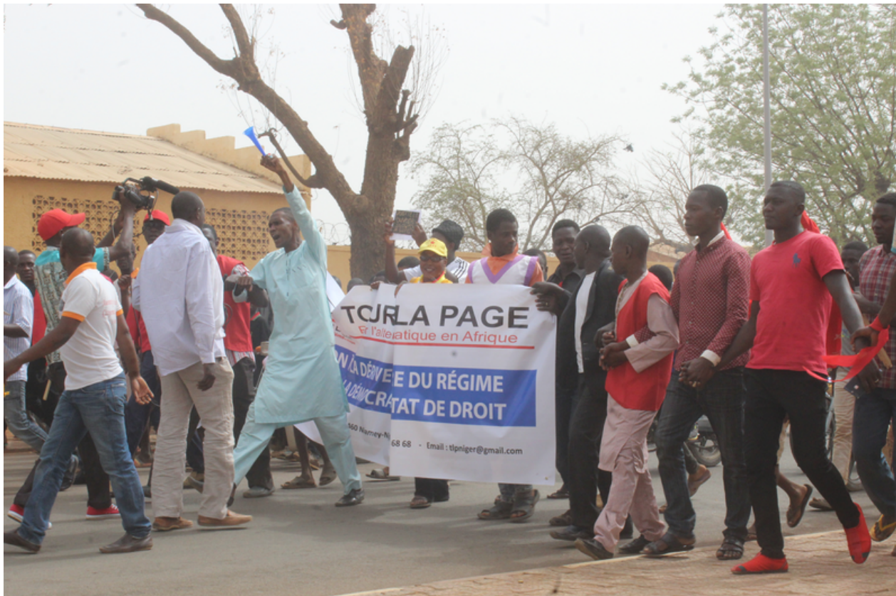
Mobilization of Tournons La Page Niger

Like 2020, the year 2021 began with obstacles related to the fight against COVID-19 that has hindered the realization of cross-cutting actions carried out by the coalitions, such as physical meetings and citizen mobilization activities. The COVID-19 pandemic has also been used as a pretext to justify the restriction of fundamental freedoms enjoyed by citizens, leading to a closure of civic space and multiple arbitrary arrests. At the European level, the health crisis has also impacted activities by limiting the possibility of organizing public events or multiplying institutional advocacy meetings.