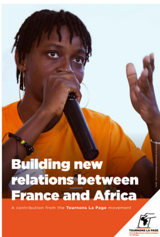
Cover of the Memorandum "Building New Relations between France and Africa" (available in English).